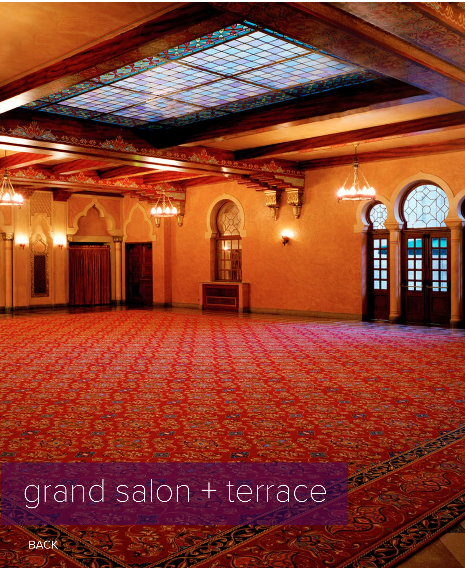
grand salon + terrace