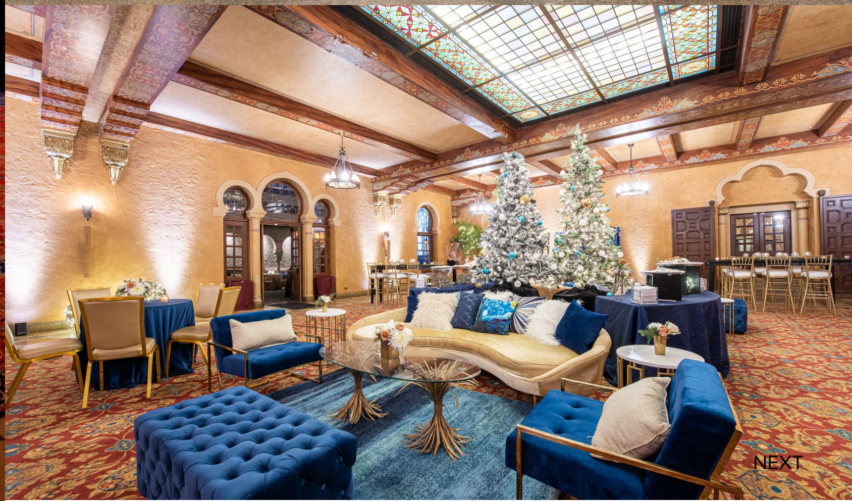
grand salon + terrace